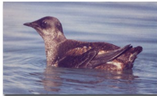
Example of retained old growth habitat and marbled murrelet, a species which prefers this habitat